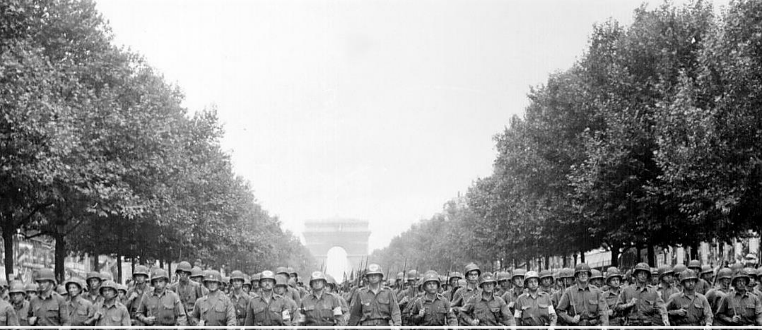
American troops on the Champs-Élysées, August 29, 1944